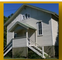
St John Bosco Church 21 Anne Street Kenilworth

St John Bosco Church Mass Time Third Sunday of the month 10:00am