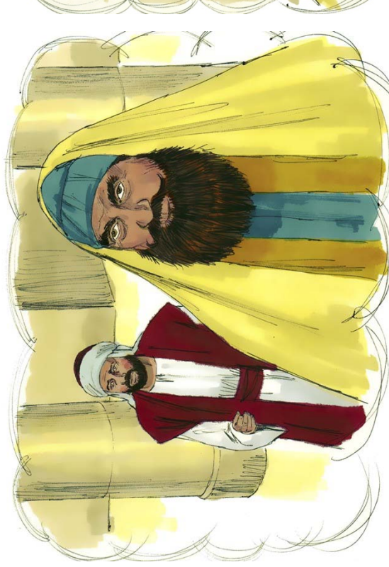
This is the Tax Collector. This is the Pharisee They both went to pray to God.