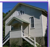
St John Bosco Church 21 Anne Street Kenilworth

St Augustine's Church Palmwoods Mass Time Third Sunday of the Month 5:30am