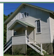
St John Bosco Church 21 Anne Street Kenilworth

St Augustine’s Church Palmwoods Mass Time Third Sunday of the Month 5:30pm