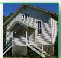
St John Bosco Church 21 Anne Street Kenilworth

St Augustine's Church Palmwoods Mass Time Third Sunday of the Month 5:30pm