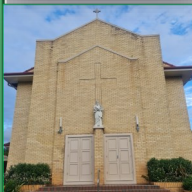
St Joseph’s Church P.O. Box 569 177 Currie Street Nambour