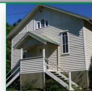
St John Bosco Church 21 Anne Street Kenilworth

St Augustine’s Church Palmwoods Mass Time Third Sunday of the Month 5:30pm