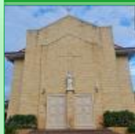
St Joseph's Church P.O. Box 569 177 Currie Street Nambour