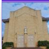
St Joseph's Church P.O. Box 569 177 Currie Street Nambour