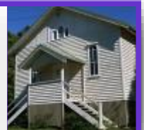
St John Bosco Church 21 Anne Street Kenilworth

St Augustine's Church Palmwoods Mass Time Third Sunday of the Month 5:30pm