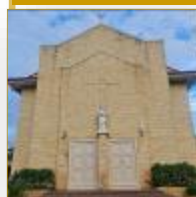
St Joseph’s Church P.O. Box 369 177 Currie Street Nambour