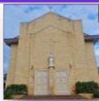
St Joseph's Church P.O. Box 569 177 Currie Street Nambour

St. Joseph's Parish Mass Times Monday 8:00am, Wednesday 10:00am, Friday 8:00am, Saturday 6:00pm, Sunday 8:00am