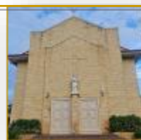
St. Joseph's Church P.O. Box 569 177 Currie Street Nambour

St. Joseph's Parish Mass Times Monday 8:00am, Wednesday 10:00am, Friday 8:00am, Saturday 6:00pm, Sunday 8:00am